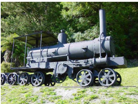
-The Davidson Bush Train (Stu Davidson, New Zealand 2008)