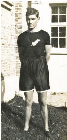
-George Davidson, The New Zealand Olympian (Jay Venables, New Zealand, 2016)